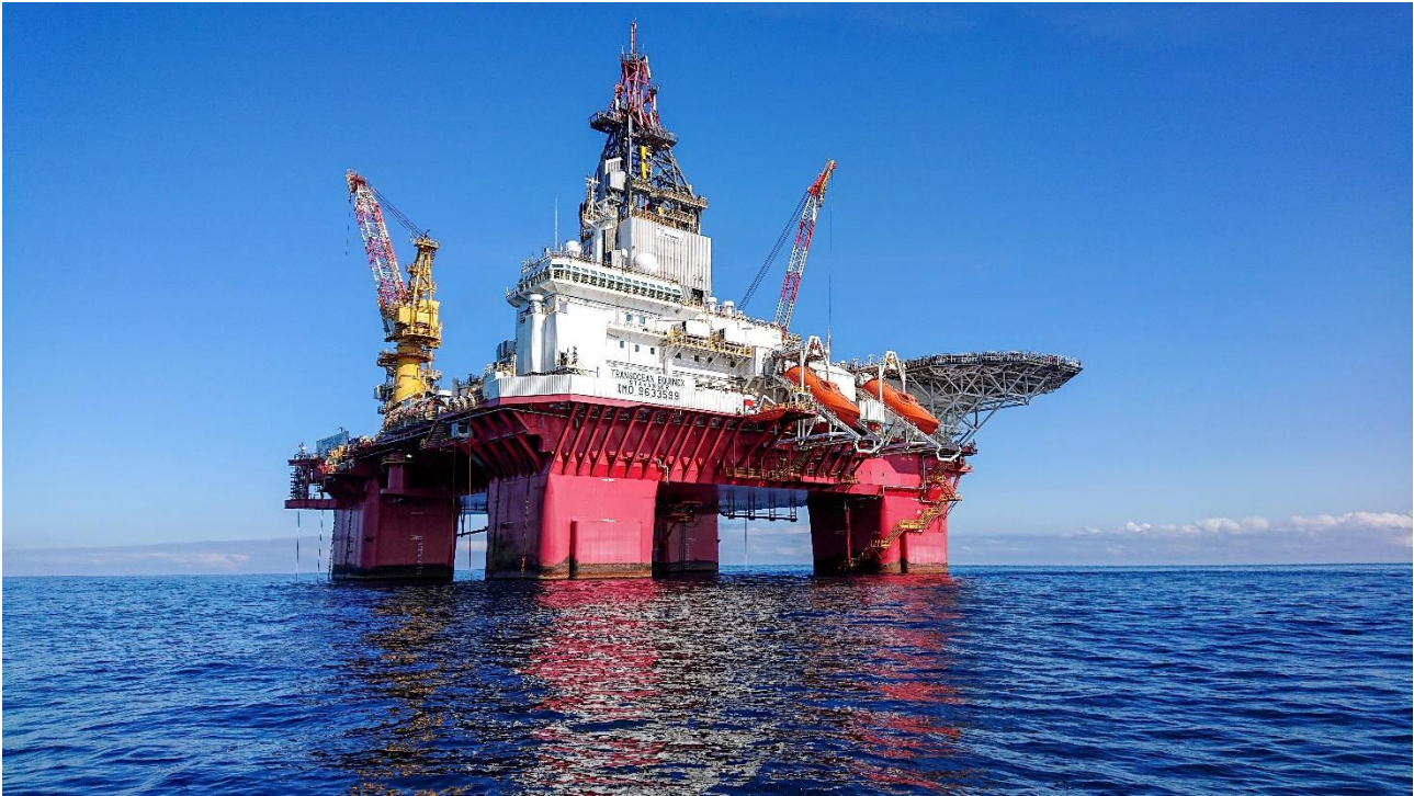
Figure 1: Transocean Equinox rig contracted to undertake drilling campaign in Otway Basin.

For further information contact the following on +61 419 567 989