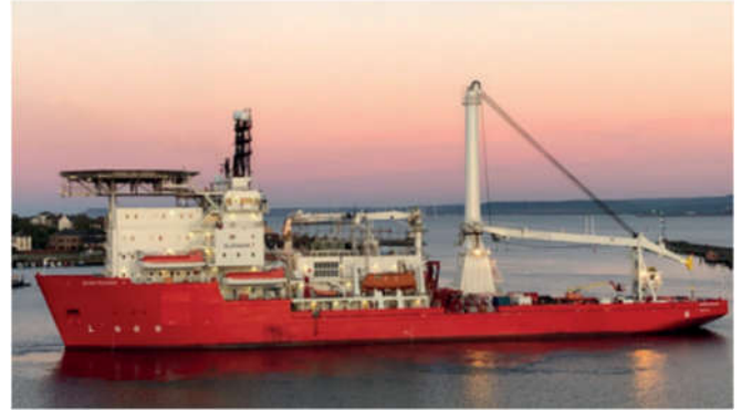
Typical Construction support vessel (CSV)

As advised by Beach in June 2023, the installation of additional seabed infrastructure to connect the four new Thylacine production wells to the existing offshore-to-onshore pipeline was commenced in February 2023. Two of the wells were successfully commissioned but two remaining well connections were delayed due to a failure of a flowline during pressure testing.